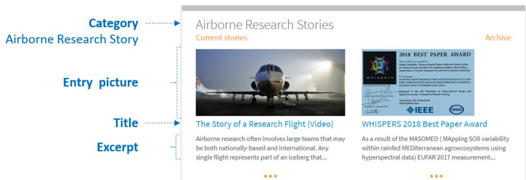
Figure 2: Airborne Research Stories window