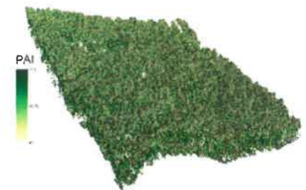
Example of output of the PAI tool for the Laegern test site