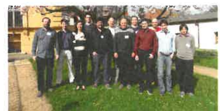
HYLIGHT working group photo

For more information, contact lls.Reusen@vito.be or visit www.eufar.net/tools